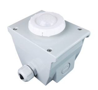
Junction Box Accessory with Sensor (factory installed)