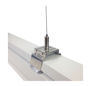
Pendant Mount accessory