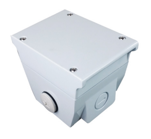
Junction Box Accessory (order separately)