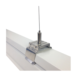
Pendant Mount accessory