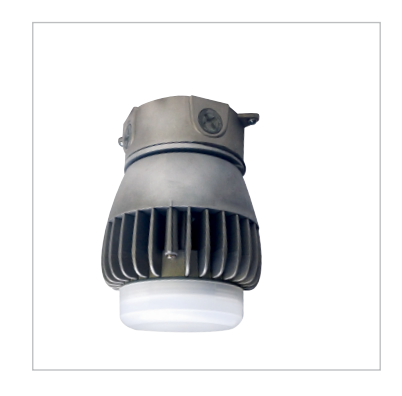
DVAKS2-LED Ceiling mount