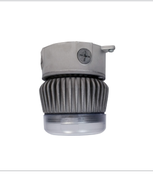
DVAKS-LED Wall mount