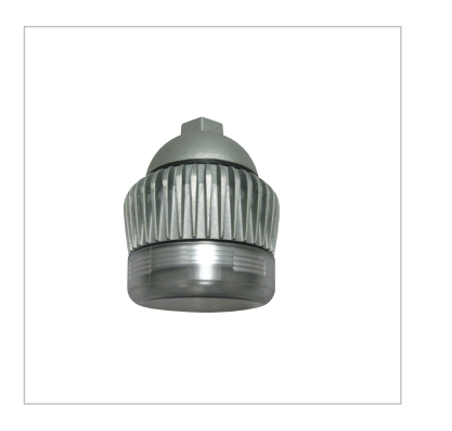
DVCS-LED Pendant mount