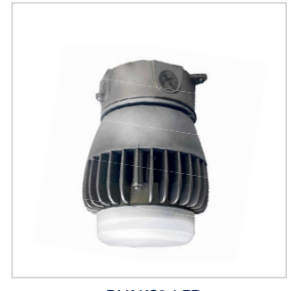
DVAKS2-LED Ceiling mount