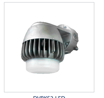
DVBKS2-LED Wall mount