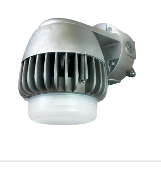
DVBKS2-LED Wall mount