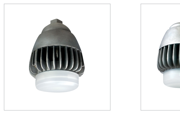
DVCS2-LED Pendant mount