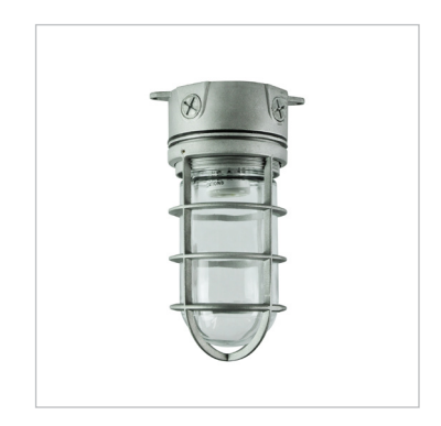
DVAKS100CG Ceiling Mount