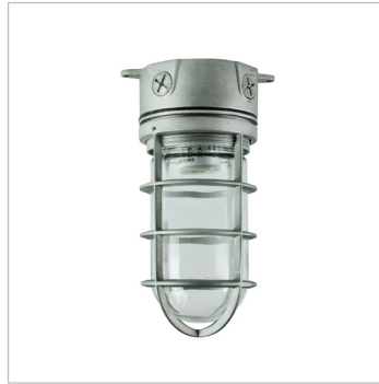
DVAKS100CG Ceiling Mount