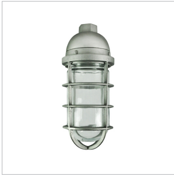
DVCBS100CG Pendant mount