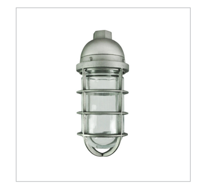
DVCS100CG Pendant mount