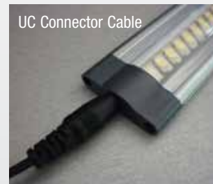
UC Connector Cable