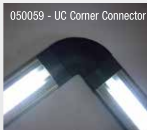
050059 - UC Corner Connector