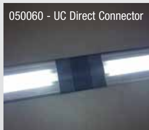
050060 - UC Direct Connector