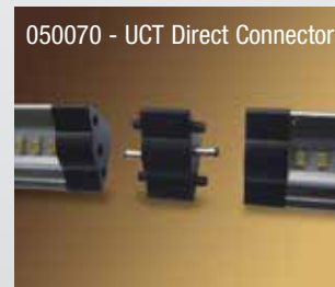
050070 - UCT Direct Connector