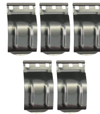
Stainless Steel Clips (SS) Optional - order separately

The High Frequency Motion Sensor uses high frequency waves to detect motion. The sensor sends out waves that bounce off nearby surfaces and return to the sensor. Motion changes the speed of the waves returning to the sensor. The sensor detects the change in speed and interprets it as occupancy which causes the light to turn on. It triggers primarily through movement of people, objects, machinery. The band of frequency that it usually operates in is <10 mW (about 10x lower than mobile phones)