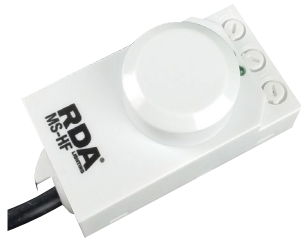
High Frequency Motion Sensor Optional - order separately