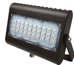
Shown with Yoke mount