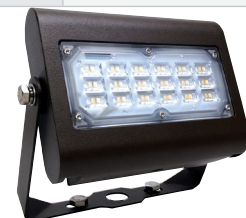
FL2-LED30 with Yoke Mount